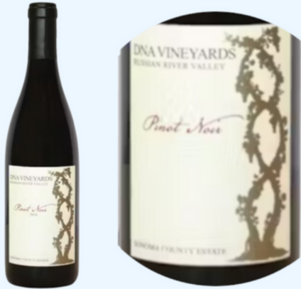
WINE DNA Vineyards Pinot Noir, 2022

Varietal Pinot Noir Appellation Russian River Valley | Sonoma Coast | North Coast | California | USA | NA